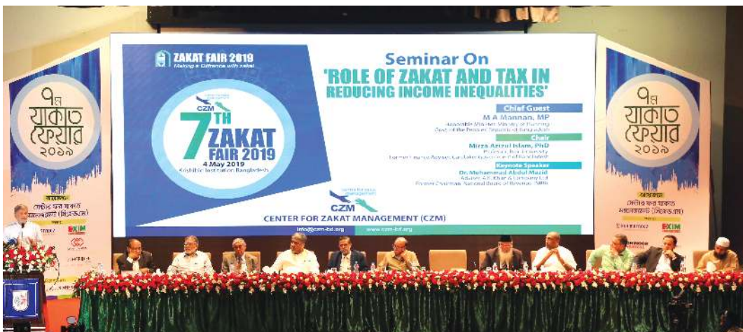
Mr. M A Mannan, MP, Honorable Minister, Ministry of Planning, GoB inaugurated 7th Zakat Fair

The 7th Zakat Fair 2019 was organized by Center for Zakat Management (CZM) on 04 May 2019 at Krishibid Institution Bangladesh Complex, Dhaka. Mr. M A Mannan, MP, Honorable Minister, Ministry of Planning, GoB inaugurated the fair as chief guest.